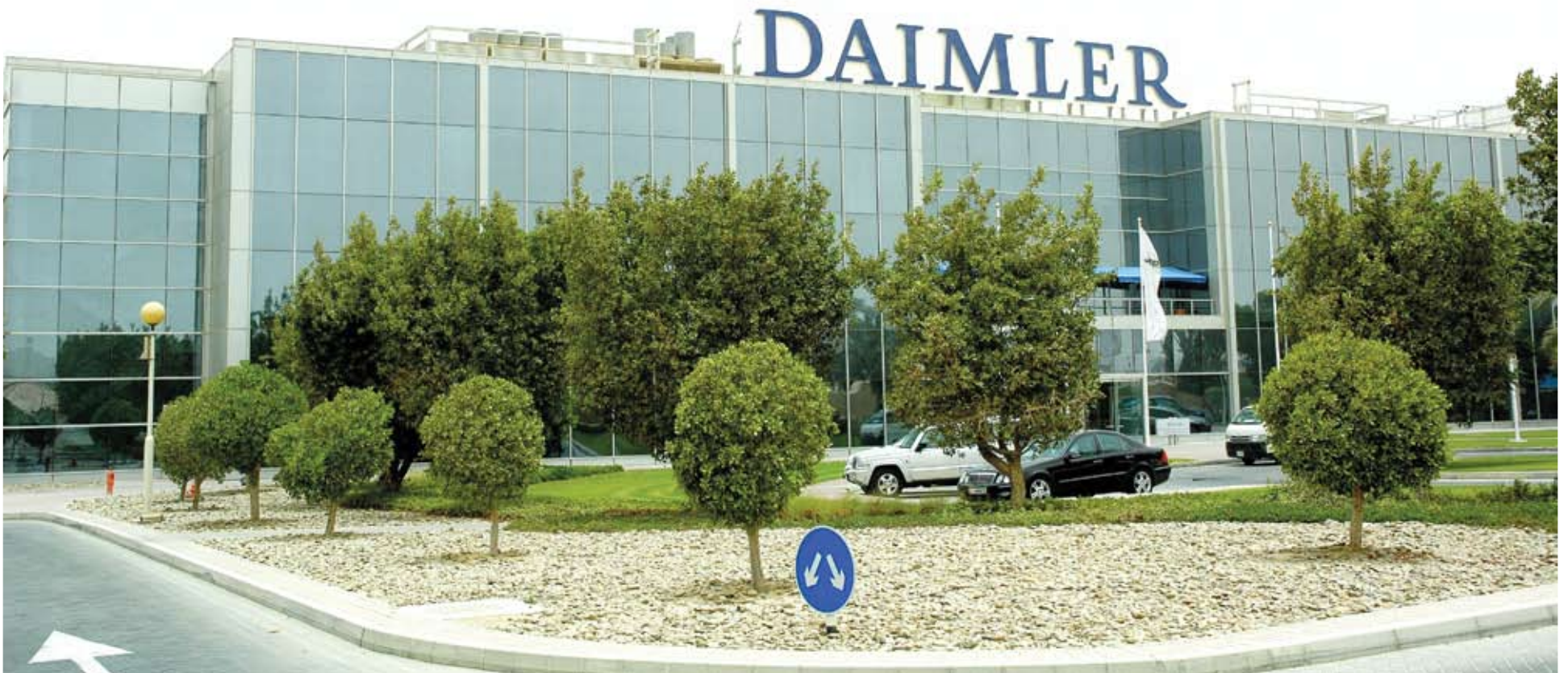
Daimler Regional Headquarters Building in Jafza

GCC will continue to drive our growth in the current fiscal as well, says Daimler's Regional Chief