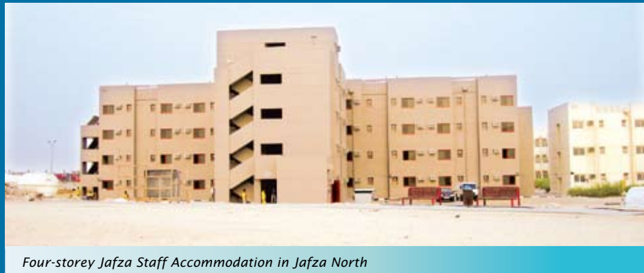
Four-storey Jafza Staff Accommodation in Jafza North

Jafza has recently made available a four-storey staff accommodation facility in Jafza North. The facility comprising eight blocks accommodates about 5,000 persons including 4,000 junior staff.