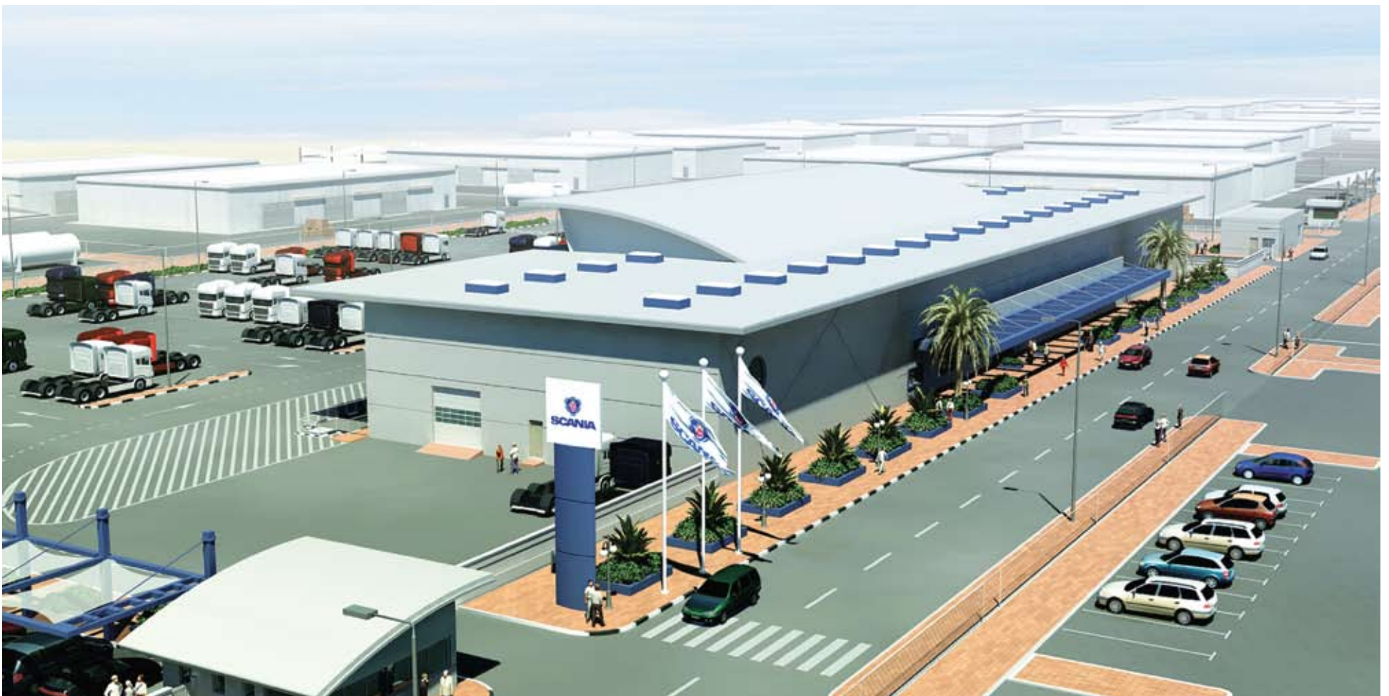
Conceptual image of upcoming Scania Assembly and Distribution facility in Jafza

Seeks to serve the Middle East Markets from its New Regional Centre