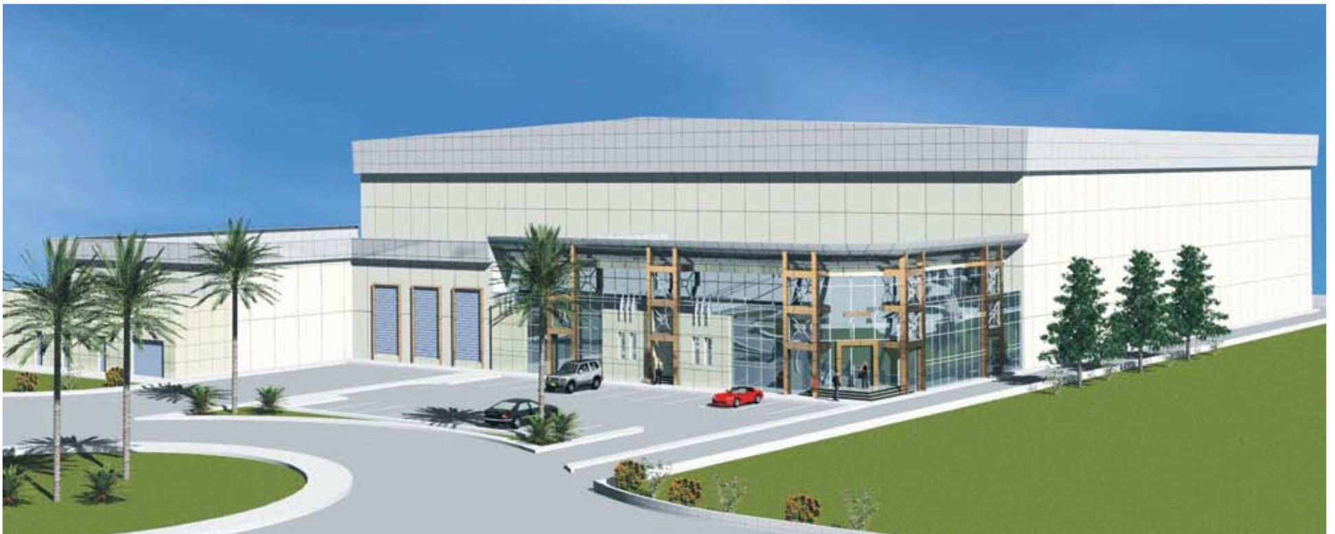
Conceptual image of Pharma World Holdings' upcoming state-of-the-art pharmaceutical supply chain management facility in Jafza

Aims to Provide Extensive Supply Chain Management Services to Global Pharma Industry in the region