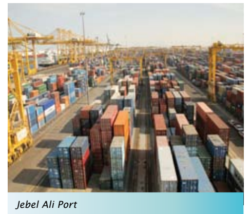
Jebel Ali Port