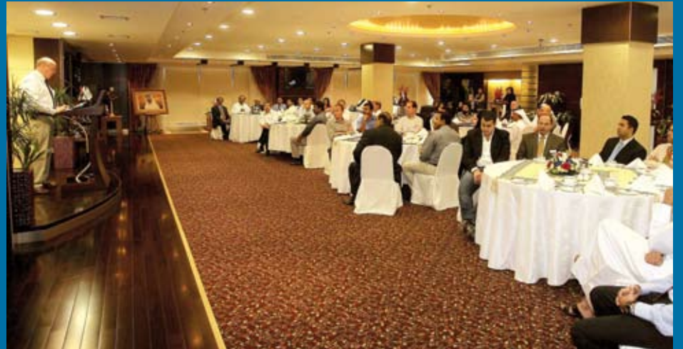
Jafza Customer-Management Get-together in June

As part of its customer communication plan, Jafza has on June 11, 2008 held its second informal Customer-Management Get-together.