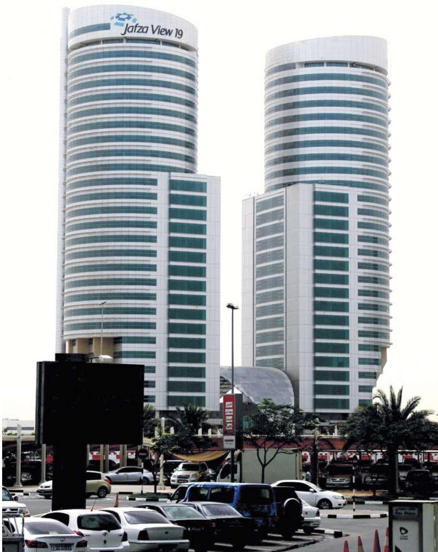
Jafza View 18 & 19

Jafza View 18 & 19 to offer Excellent Office Space within a very Modern Environment