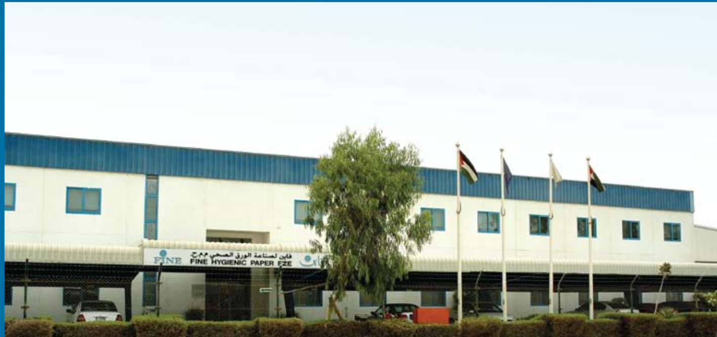
FINE Hygienic Paper FZE facility in Jafza

FINE is the first company in the region to get the coveted certification