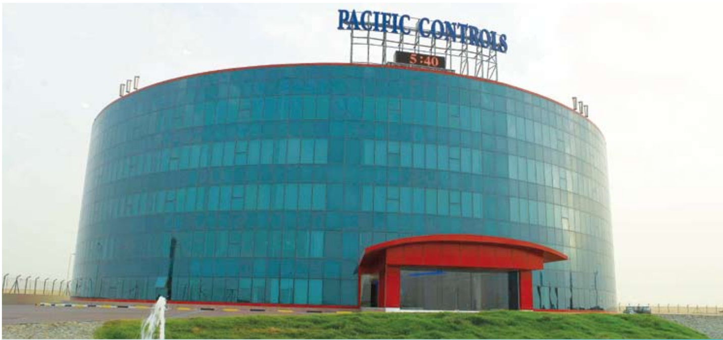
Pacific Controls Global Headquarters Building

Receives global recognition for energy efficient integrated automation and control systems