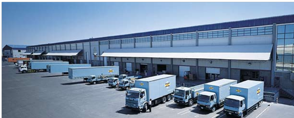
GAC Headquarters in Jafza

Merger strengthens GAC presence in North Sea Oil & Gas Sector