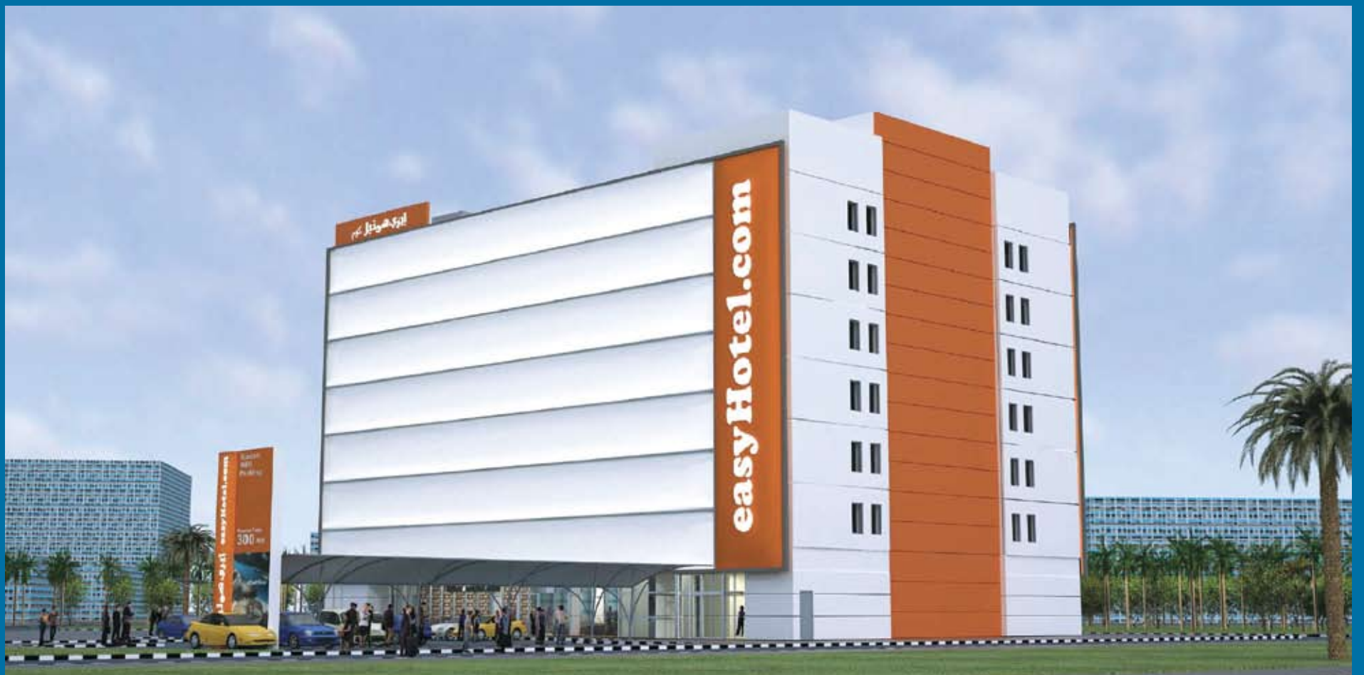
Conceptual image of upcoming easyHotel in Jafza

Jafza and Nakheel, one of the world's largest and most innovative real estate developers, have partnered to develop an innovative budget hotel in Jebel Ali Free Zone. The upcoming hotel, which will operate under the easyHotel brand, will cater to the boarding and lodging requirements of a rapidly growing number of business visitors and investors who come to Jafza to explore business