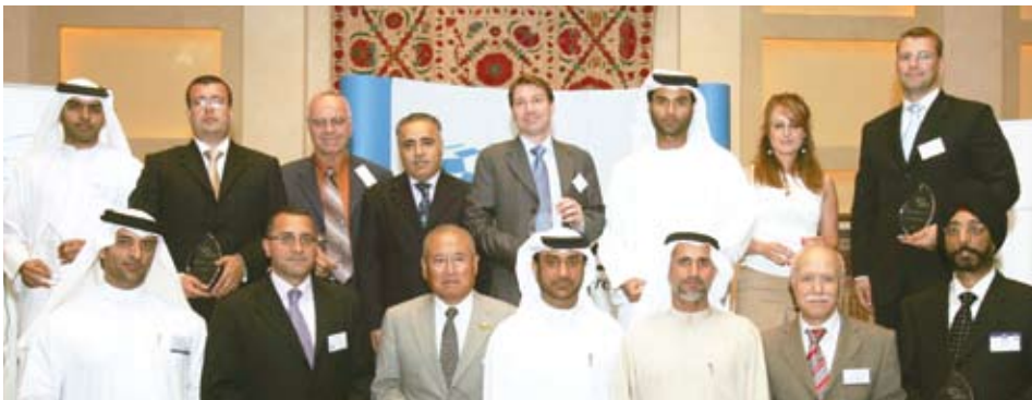
EZW honours Strategic Business Associates

Economic Zones World (EZW) hosted a business Get-together on May 06, 2008 for its business consultants and associates, who have endorsed and promoted EZW and its Group companies among the prospective investors across the world, playing a key role in the expansion of the profile of Economic Zones World Group companies in 2007.