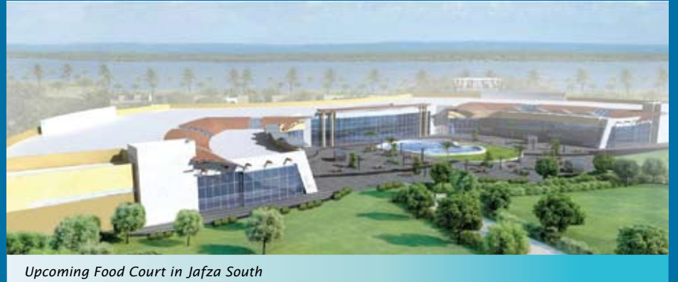
Upcoming Food Court in Jafza South