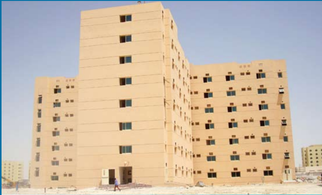
Seven-storey Jafza Staff Accommodation in Jafza South

A well structured food court is also under construction within the new complex, which will cater to the residents' food and other day to day requirements. The 18,000