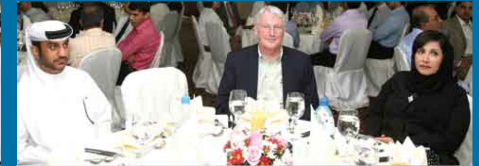
Jafza senior officials with clients

EZW firmly believes in direct interaction with clients to keep its services updated, seamless and compatible to its global client needs.