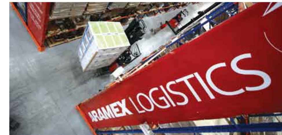
New Aramex Logistics facility in Jafza

Aramex is the leading provider of total transportation solutions, offering express delivery, freight forwarding and logistics solutions. Founded 25 years ago, Aramex employs more than 6,500 persons in 304 offices in 192 major cities, and has a strong global alliance network offering a worldwide presence.