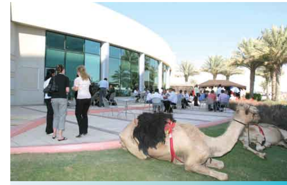
Eid Al Adha celebrations at Jafza

Reaches out to its multinational community to enjoy the festival together