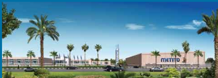
Artistic impression of the upcoming Metito Headquarters Building in TechnoPark

Metito, TechnoPark-based world's leading desalination, water and waste water management company has seen almost four-fold growth in its annual turnover in the last four years, growing from US$ 90 million in 2004 to over US$ 340 million in 2007, to become one of the fastest growing water management solution providers in the world.