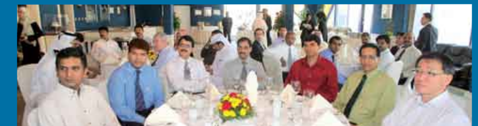
Jafza clients at the event