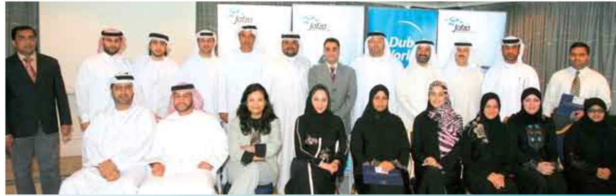
Jafza SRS Award winners and Jafza Management team at Award Distribution Ceremony

The suggestions submitted by Jafza employees between August and October this year helped the Jebel Ali Free Zone save AED 6.25 million in 2007. In a ceremony held recently at Old Wheel House at Jebel Ali Port, Jafza honoured