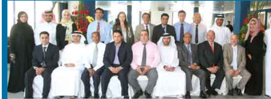
Jafza senior officials with clients

Holds networking events to establish direct contact with clients