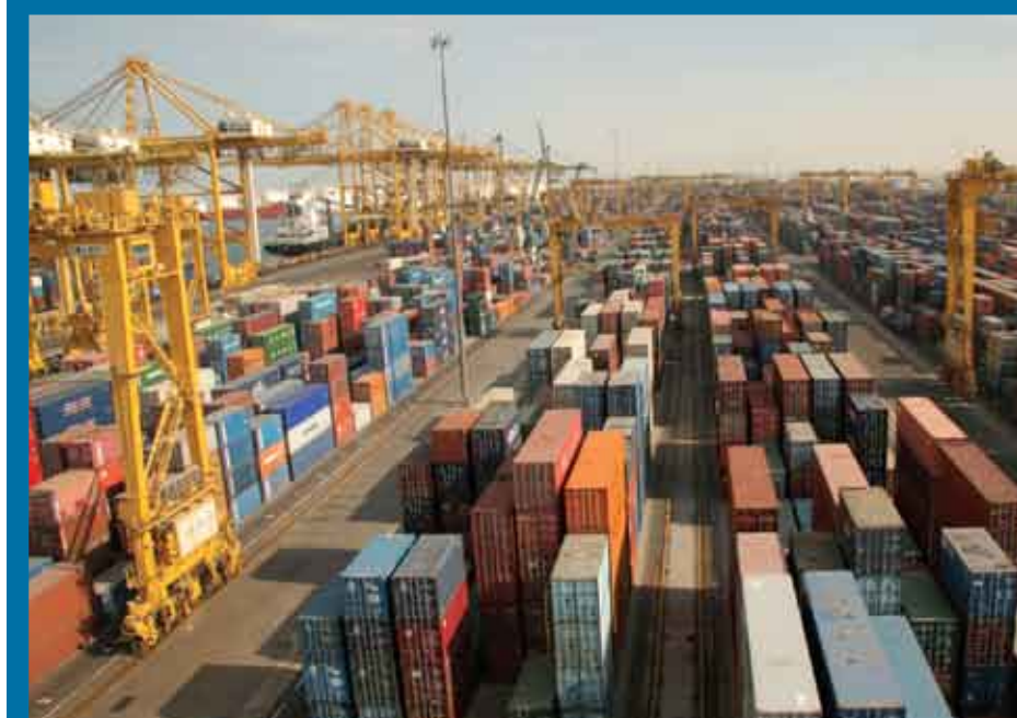
Jebel Ali container terminal

New electronic service to enhance work-flow efficiency at the port